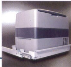
Ball-bearing and roller-bearing slideout utility and cargo trays.

We design and manufacture power and manual step systems to accommodate personnel access. We also make rugged storage solution products that provide ready access and secure storage of equipment for interior or exterior application on specialized vehicles and heavy equipment.