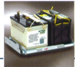
Slideout battery trays in many sizes.