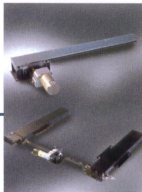
Room slideout systems to move a small compartment or a full wall.

Extending useable space beyond the footprint of any specialized vehicle increases the vehicle's function. We design and build slideout compartments and rooms that allow you to take specialized equipment to the next level.