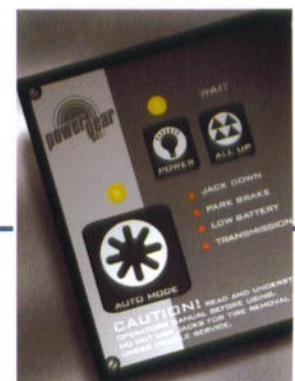
All systems include state-of-the-art controls.