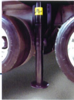
Air-powered hydraulic landing gear systems.

From compact jacks to fully-automatic, heavy-duty hydraulic cylinders, our line of leveling and stabilization systems cover a full range of heavy equipment needs. Engineered for severe operating environments and maximum operator control, our systems deliver robust leveling and stability while providing innovative safety for personnel and equipment.