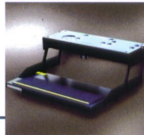
Electric and manual entry steps.