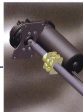
Fully developed, proven actuation systems.